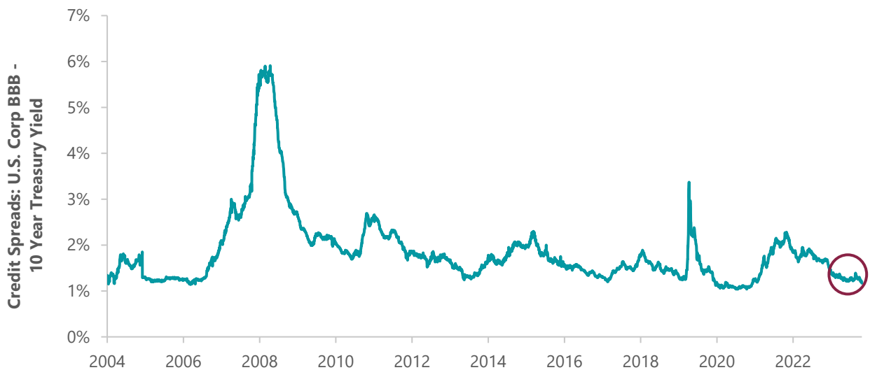
Exhibit 1: Liquidity Has Rarely Been So Plentiful

As of 30 September 2024.