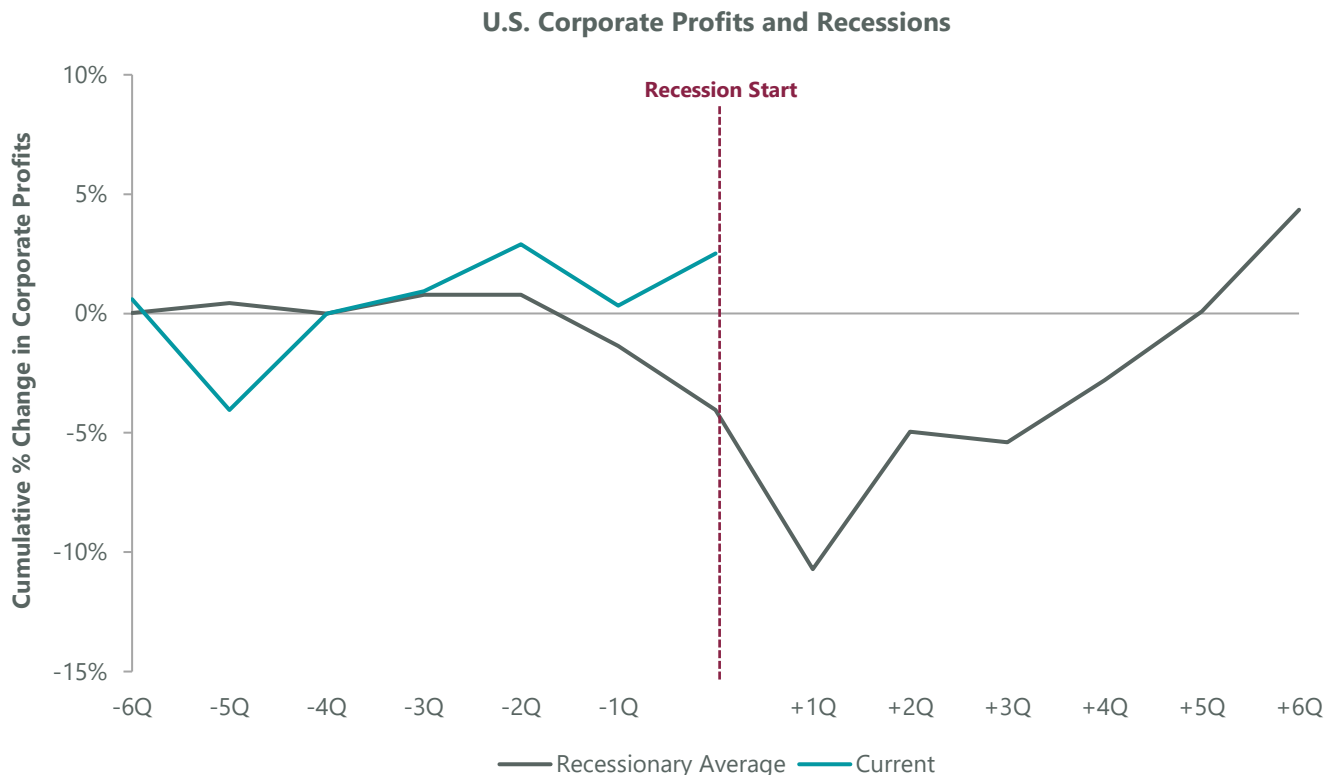
Exhibit 2: Profits Don't Look Recessionary

Third-quarter earnings results were very strong with roughly two-thirds of companies beating revenue forecasts, and, overall, companies delivering record margins. All 11 sectors had healthy results, indicating a broadening of earnings participation that we had been anticipating. In short, corporate America is in good shape right now, and the environment looks distinctly non-recessionary.