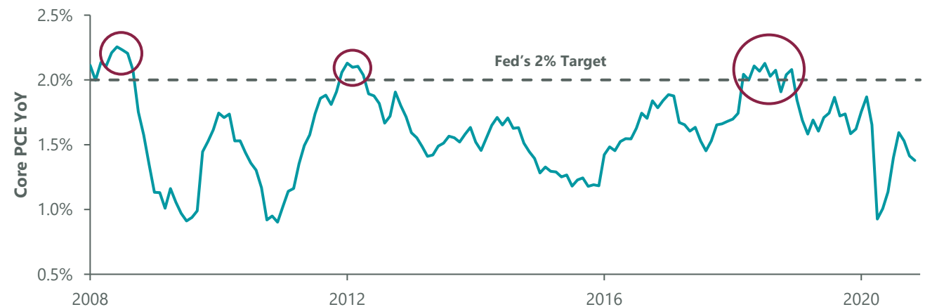
Exhibit 3: Fed’s New Framework

Nevertheless, inflationary pressure will build in the coming months as economic reopening allows consumers to return to activities such as travel (airlines in particular), giving way to rising prices as demand returns. This second force is consistent with the increase in inflation that occurred last summer with the initial reopening. However, consumers are likely to reallocate some of their spending away from areas that benefited from social distancing guidelines including home furnishings (larger ticket appliances in particular) where demand is likely to soften. This should put some downward pressure on prices. Still, the net effect is likely to be higher near-term inflation.