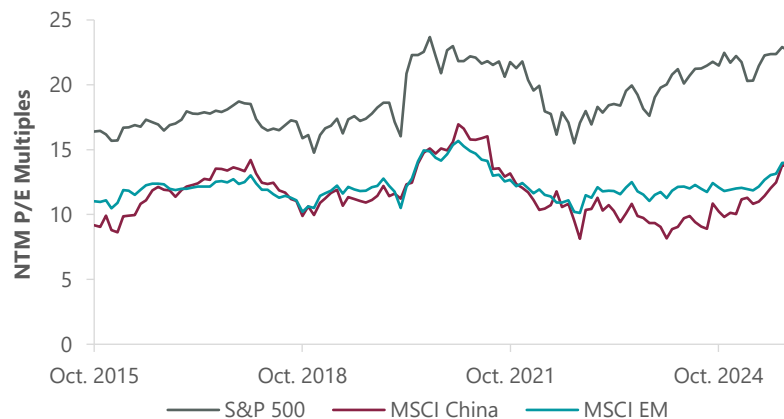
Exhibit 1: China — Valuation Opportunity Remains Compelling

Source: FactSet. Data as of Oct. 6, 2025.